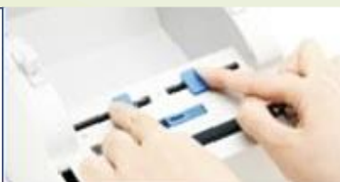
Dual sensor Accurate positioning