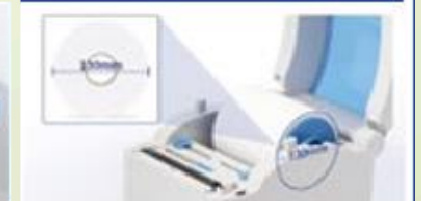
Supports paper rolls with OD 130mm