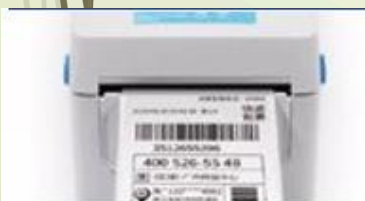
200mm/s printing speed

Meet the needs of real-time, large-scale label printing, and supports thermal roll paper, self-adhesive paper, express delivery labels and other paper types.