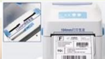
118mm paper loading width